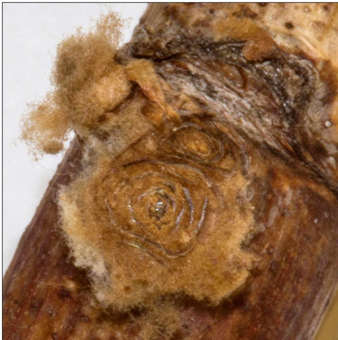
Dead primary (lower) and secondary (upper) grape buds due to winter cold injury. Different species and varieties of grapes have different abilities to survive particular cold temperatures, depending in part on their genetic makeup.

highly variable temperatures in the early spring, these vines can incur significant damage or even death. As interest and consumer demand has led to an expansion of grape cultivation to non-traditional growing areas with more drastic environmental variation, the need for broader information regarding the genetic and physiological mechanisms that impact survival and productivity has also increased, including an understanding of how grapevines protect themselves from extreme low temperatures or avoid early bud break in the spring.