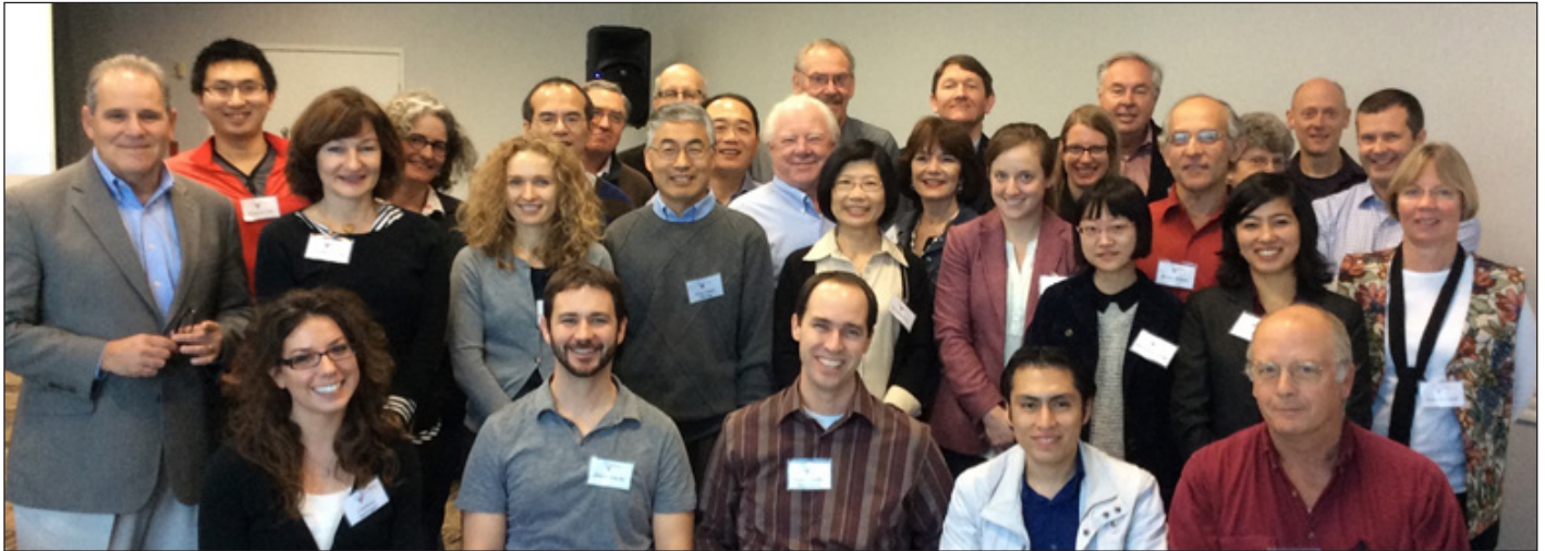
The fourth annual VitisGen meeting of project directors, collaborators, and industry advisory panel members took place January 8–9, 2015 in San Diego, California.